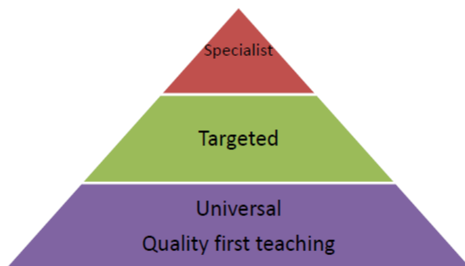
The graduated approach